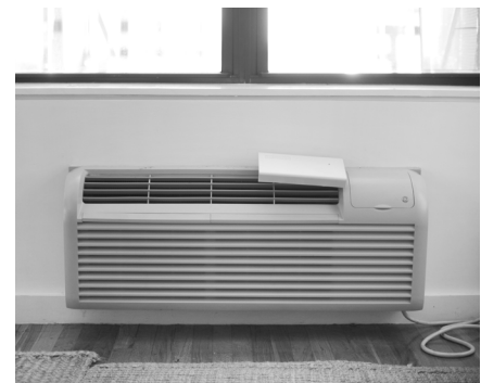
Typical PTAC (interior view)