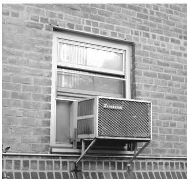
Typical Window AC (exterior view)

This tech primer will outline simple, low-cost measures and maintenance practices to ensure gaps around ACs are well sealed in order to improve efficiency, reduce drafts and moisture buildup, and maintain a consistent indoor temperature.