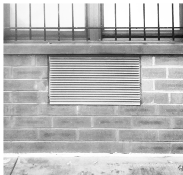
Typical Sleeve AC (exterior view)