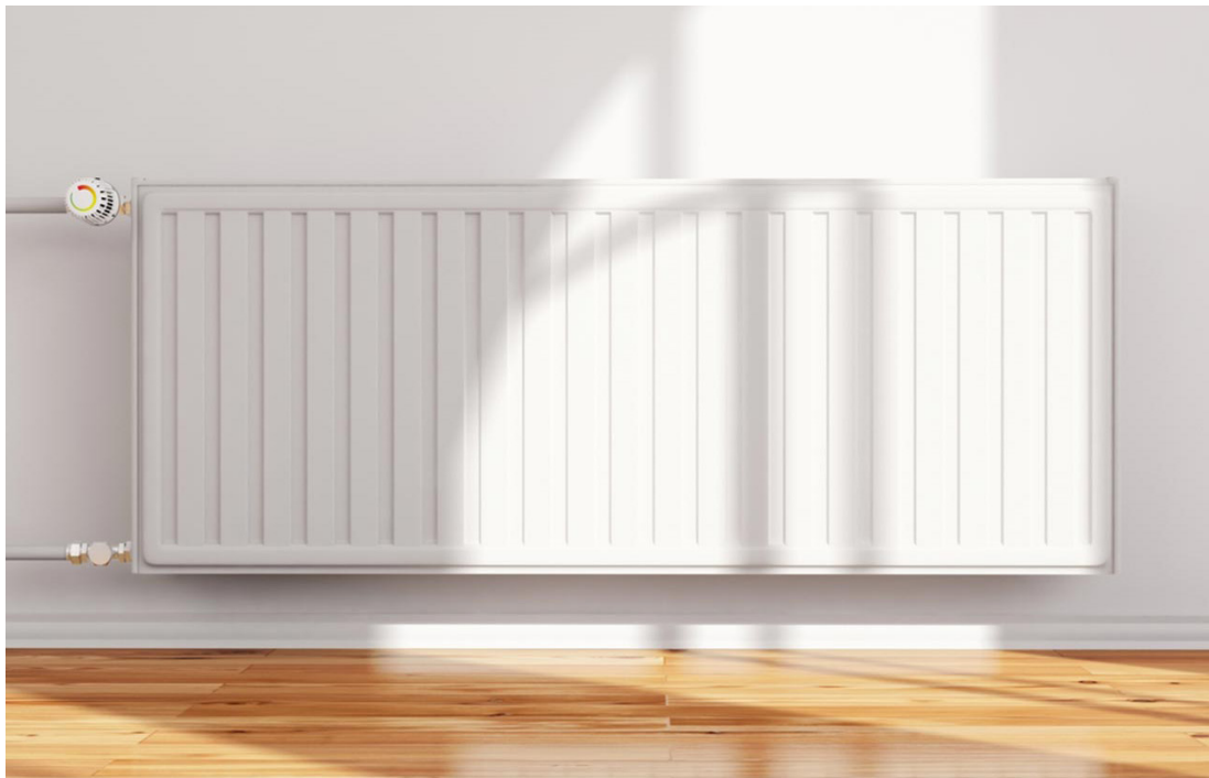
Brendon Harris Hydronics

*ratings are based on system end use, see back cover for details.