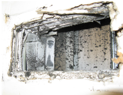
View into a dusty, grimy air duct.