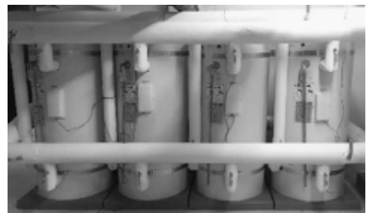
Indoor hot water storage tanks.

C Control Condensate – Both condensate formed on the heat pump coil during summer and ice melted by the heat pump’s defrost mode during winter will need to be safely drained.